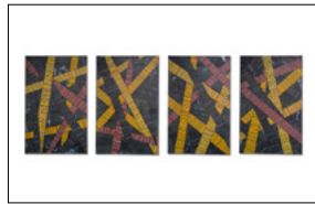
Klaus Moje, The Portland Panels , 2007. four fused and diamond-polished glass panels each: 74.5" × 47.25".