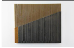
Nathan Sandberg, Again , 2010. kilnformed glass, 15.5" × 18.5" × 1".