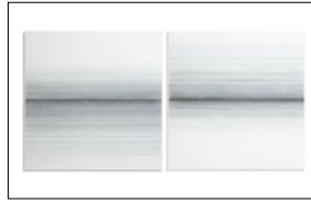
Cobi Cockburn, A State of Illumination , 2013. kilnformed and coldworked glass, 45.25" × 45.25" × 1.375"