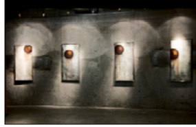
Ted Sawyer, Note I-V , 2008. Four kilnformed glass panels, each: 48" × 24" × 0.25".