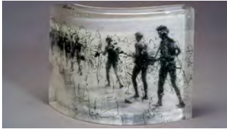
Jeffrey Sarmiento, March , 2005, cast and enameled glass, 8 x 11 x 4 inches.