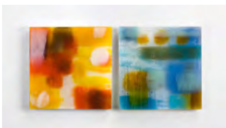
Martha Pfanschmidt, Fall into Winter , 2010, kilnformed glass, 6 x 12.5 x 0.5 inches (installed).