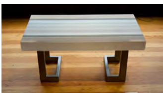
Daniel Schwoerer, Bullseye Studios, Bullseye Bench 4 , 2009, kilnformed and coldworked glass, 16.5 x 34 x 18 inches.