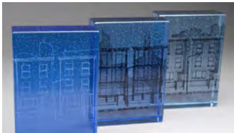
Jeremy Lepisto, Scene Segments , 2006, kilnformed glass, 6.875 x 15 x 6.5 inches installed.