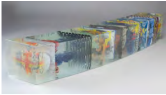
Jeffrey Sarmiento, Encyclopædia , 2007, enameled and cast glass, 6.625 x 38.625 x 6.875 inches.