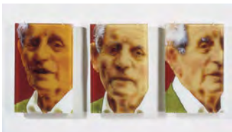
Catharine Newell, Glimpses of Mr. Hidcote , 2002, kilnformed glass, 18 x 12 x 0.75 inches (per panel).