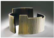
Steve Klein, Shelter 5 , 2010. Kilnformed glass, 8.375 x 17.125 x 16.5 inches (21 x 43.5 x 42 cm). www.bullseyegallery.com