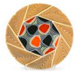
Jim Weiler, untitled plate , 2011. www.weilerglass.com