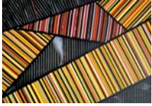
Klaus Moje, The Portland Panels: Choreographed Geometry (detail), 2007. Sheet glass, fused and diamond polished. Four panels: each 74.5 x 47.25 inches (189.2 x 120 cm). www.bullseyegallery.com