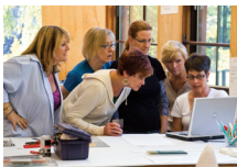
Photographer: Steven Immerman. www.clearwaterglass.com