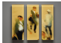
Catharine Newell, Here and There: Grand Central I , 2010. Kilnformed glass, 17.625 x 20.5 x 2 inches. www.bullseyegallery.com