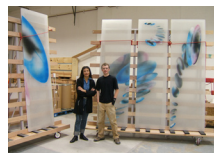
Ellen George, BLOOM , 2008. (Before installation.)