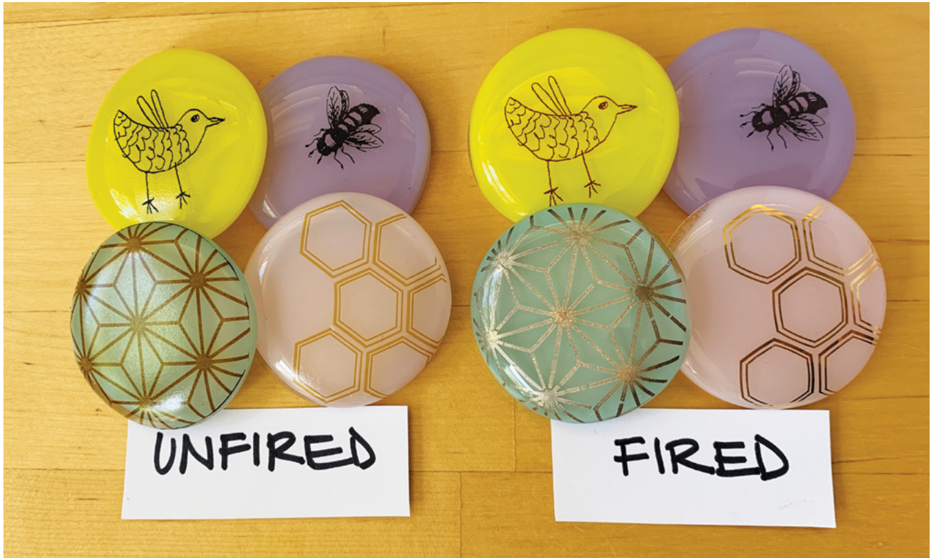
ABOVE: Projects made with Fusible Decal Paper and pre-printed Milestone Decals shown with unfired and fired decals.